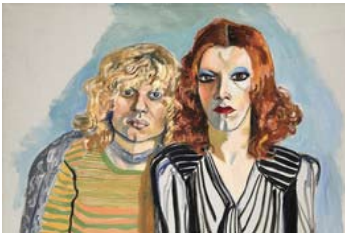
$400,000 | Alice Neel